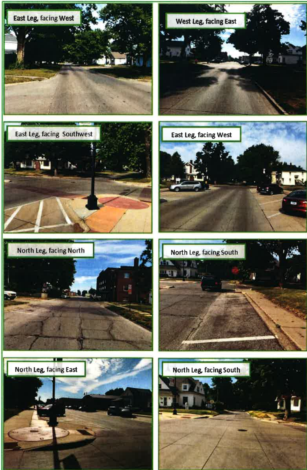
Exhibit 3 – Views on Roche Street & Robinson Street